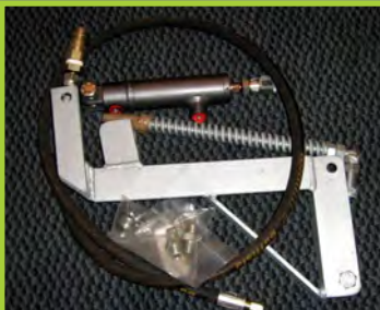
hydraulic remote ALL MODELS EXCEPT SP