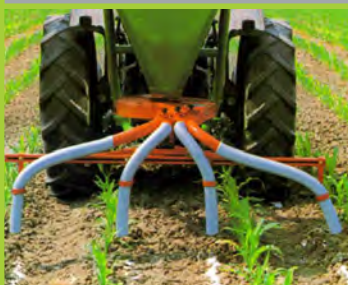
four row discharge kit SP & SR/S RANGE ONLY