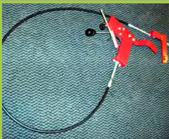
cable remote ALL MODELS EXCEPT SQTF & TORNADO