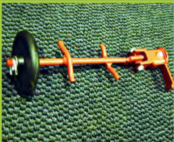
agitator stirrer ALL MODELS EXCEPT SR/DD & TORNADO