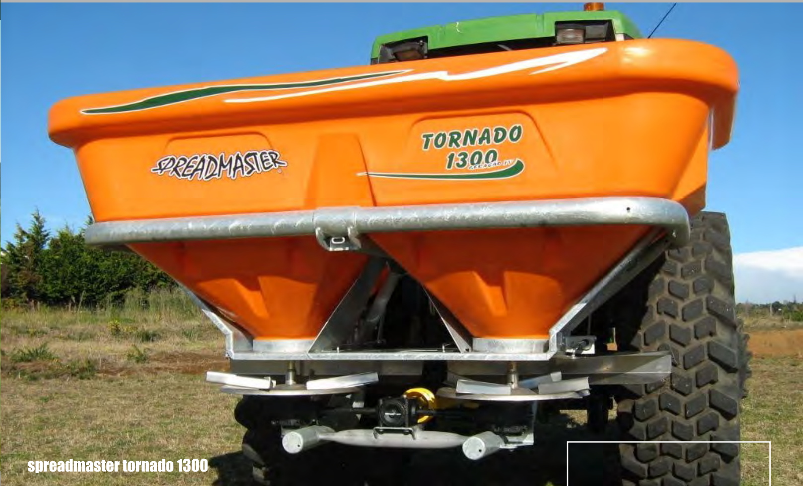
spreadmaster tornado 1300