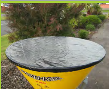
cover ALL MODELS