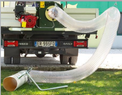
6m long suction pipe