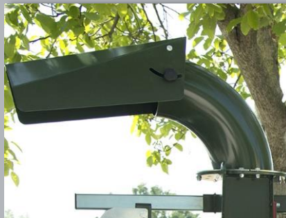
Rotary Ejection Pipe with adjustable throw depth