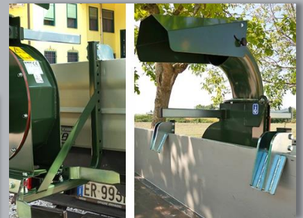
Tail Board Connection