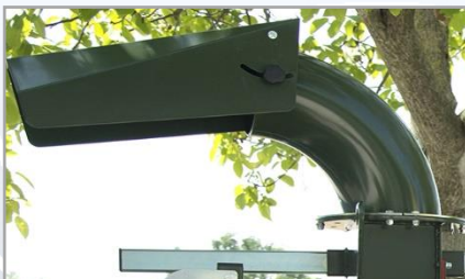
Rotary ejection pipe - adjustable