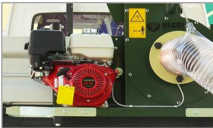
2 engine options