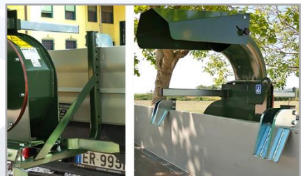
Tail board connection