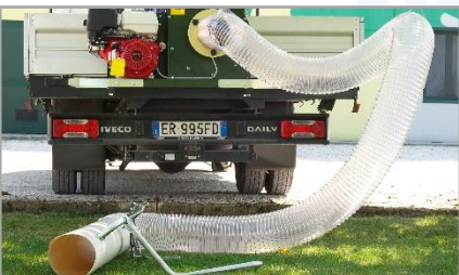
6 metre long suction pipe